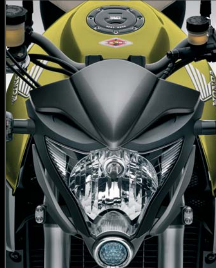
Meter visor kit

08F62 MFN 800 I Fitting Time 0.2 hrs I RRP £125.00 • stylish titanium-look radiator shroud set • replaces the factory standard shrouds