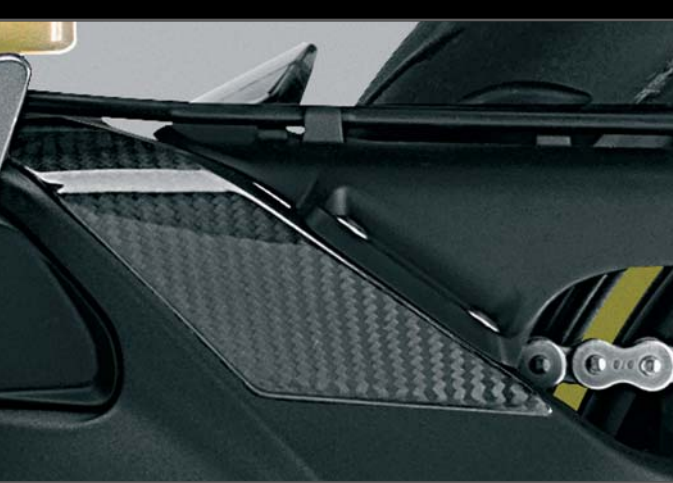
Carbon-fibre swingarm protector 08P59 MFN 800 | Fitting Time 0.1 hrs | RRP £95.00 • moulded carbon-fibre guard • to be applied on swingarm to protect it from boot scuffs (Availability TBC)