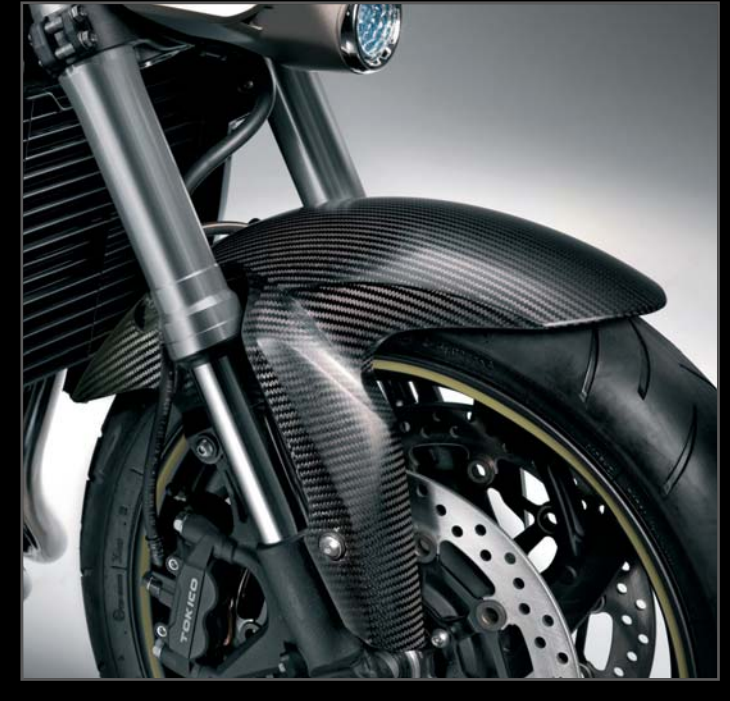
Carbon-fibre front mudguard

08P64 MFN 800 I Fitting Time 0.2 hrs I RRP £275.00 • supreme quality carbon-fibre front mudguard gives your bike that extra racy look