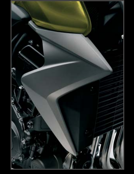
Radiator shroud kit

08F62 MFN 800 I Fitting Time 0.2 hrs I RRP £125.00 • stylish titanium-look radiator shroud set • replaces the factory standard shrouds